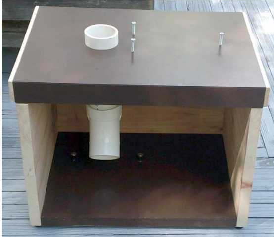
Figure 3 Feeder Mounting Details