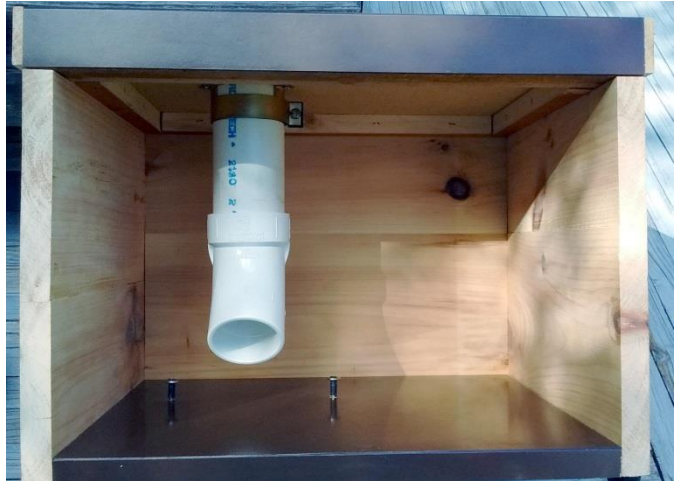
Figure 4 PVC Pipe and Food Tray Details