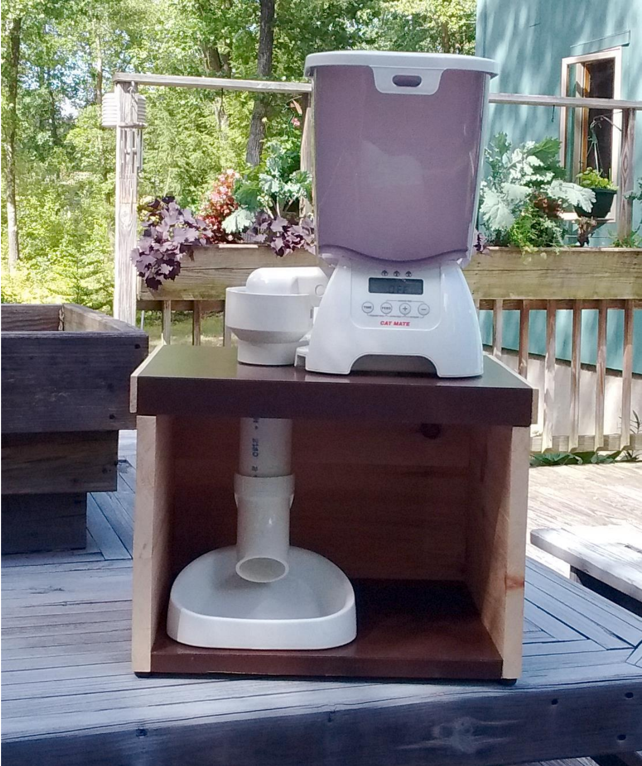
Figure 2 Cat Proof Automatic Feeder

Four rubber bumpers screwed into the bottom finished it off.