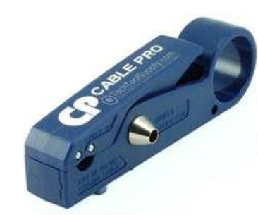
Cable Pro PSA596 Coax Stripper