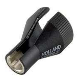
Holland CIT-1 F-Connector Wrench